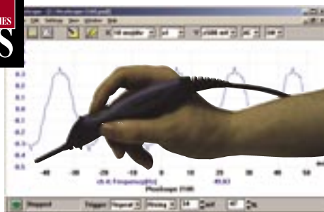
Small enough and light enough to carry with you anywhere

The PicoScope 2105 PC Oscilloscope combines features integral to many high-performance bench-top oscilloscopes, in a small, lightweight and ergonomic design that fits perfectly in the hand. When used in conjunction with the PicoScope software, the oscilloscope converts any laptop or desktop PC with USB support into a powerful oscilloscope, without the need for additional probes or power supplies. An entry-level version, the PicoScope 2104, is also available to accommodate less demanding applications.